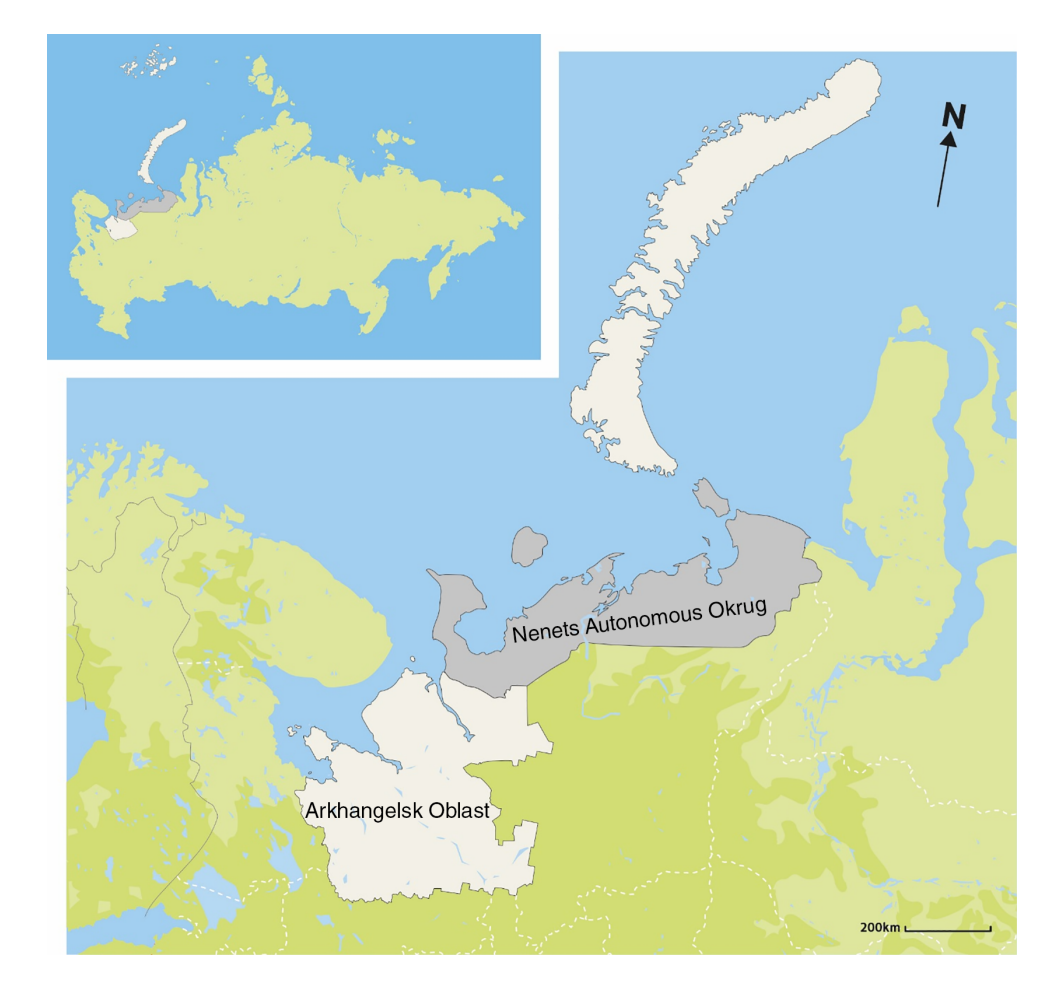
FIGURE 2 Study regions in the Russian Arctic. Grey shading denotes the Nenets autonomous Okrug (NAO) and white shading, Arkhangelsk oblast (AO). In AO, only hunters on the mainland (and not the island of Novaya Zemlya) were surveyed

The questionnaire comprised 52 questions; question wording and methods were refined following a pilot survey of 50 inhabitants from one settlement in the NAO between June 24 and July 1, 2015. Only interviews conducted in 2016 are used in the analyses (S1). Participants were asked about their sociodemographic status, residence, hunting frequency and hunter identity (i.e., reason for regarding oneself