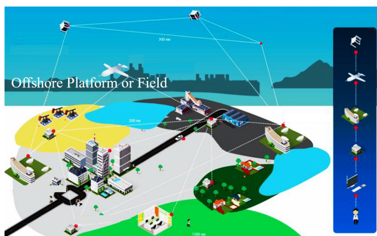
Figure 2. A secure fiber-optic communication system based on quantum cryptography technology with a remote marine platform.